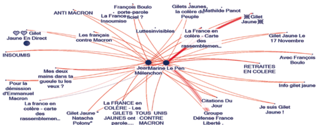
Chart 3: Pages sharing both Marine Le Pen and Jean-Luc Mélenchon at least 10 times each

FB Pages that shared more than 10 times the posts of each leader had very specific profiles. A large proportion of them claimed to belong to the Yellow Vests movement, a critical social move-